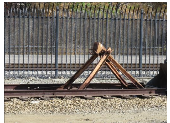
Track bumper on the San Luis Obispo pocket track, where helper diesel locomotives for Cuesta Grade were kept.

Dirt pile at the end of San Luis Obispo's team track. A loading ramp out of view to the left allows transfers between rail cars and trucks. The team track, connected to the main track by a switch, gets its name from the days of horse-drawn wagons.