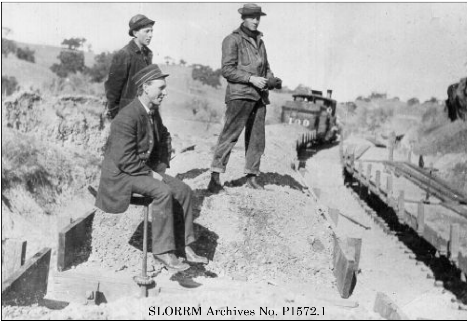
No. P1572.1

But 27 years earlier, there was work to be done, in fine working weather.