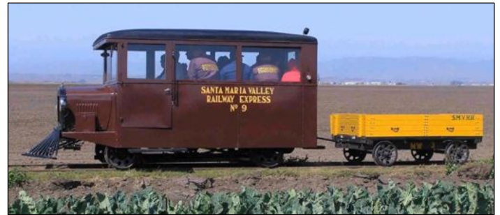
Santa Maria Valley Railroad "Railway Express" motor No. 9 pulls a trailer along that line during an excursion in 2008.

https://www.psrsm.org/trains/passenger/smv-9/