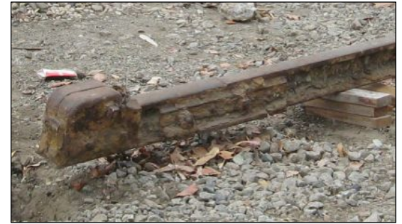
Wheel stop bolted to rail, from San Luis Obispo's roundhouse area, removed with permission of current owner Union Pacific Railroad.

Below, wheel stops at the San Luis Obispo Surfliner layover facility.