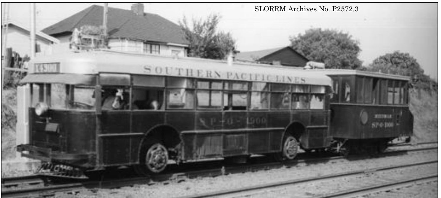
SLORRM Archives No. P2572.3

The one shown below, or one like it, must have rumbled through the Central Coast, keeping Safety First.