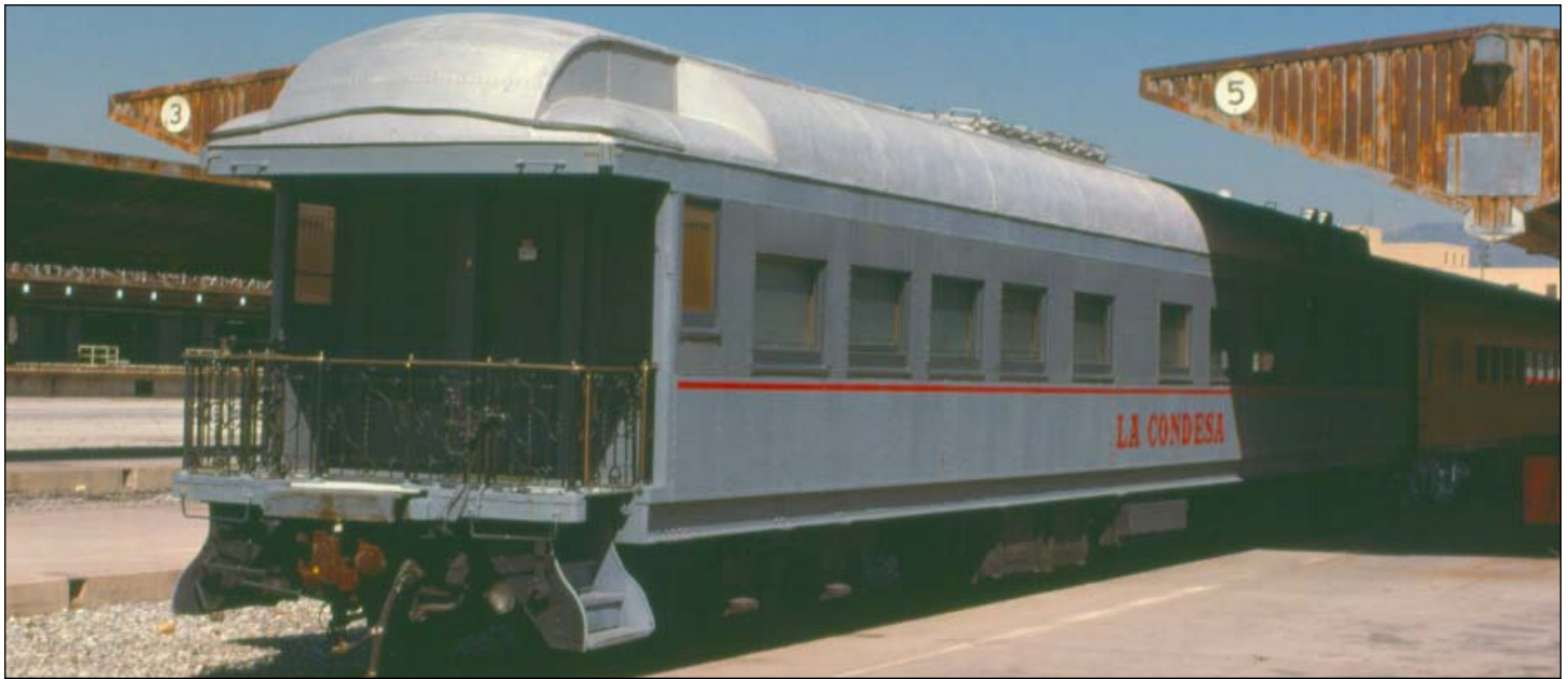
Private car La Condesa parked at Los Angeles Union Passenger Terminal behind Union Pacific Business Car in late 1983.