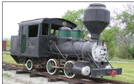
SLORRM's Dagney was on display.