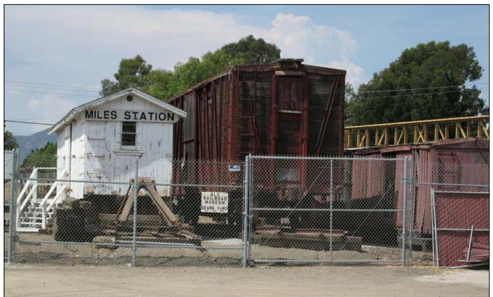
Emily Street Yard looking northeast from Emily Street, July 23, 2006